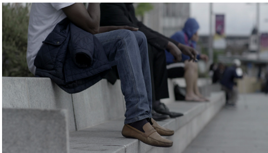
Figure 2 The act of sitting